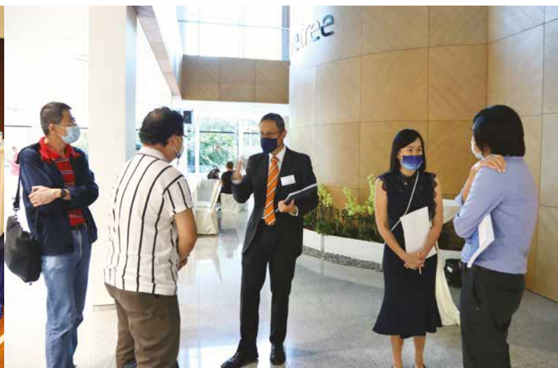
Engagement with Unitholders at MIT's 12 th Annual General Meeting.