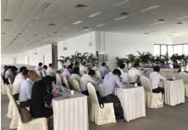
Analyst briefing on 2Q and 1HFY18/19 results held at MIT's latest AEI at 30A Kallang Place.