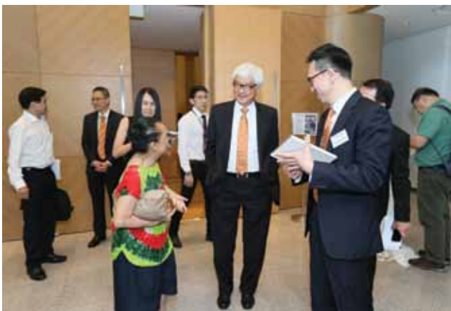
The annual general meeting serves as an important communication channel between the Board, Management and Unitholders.